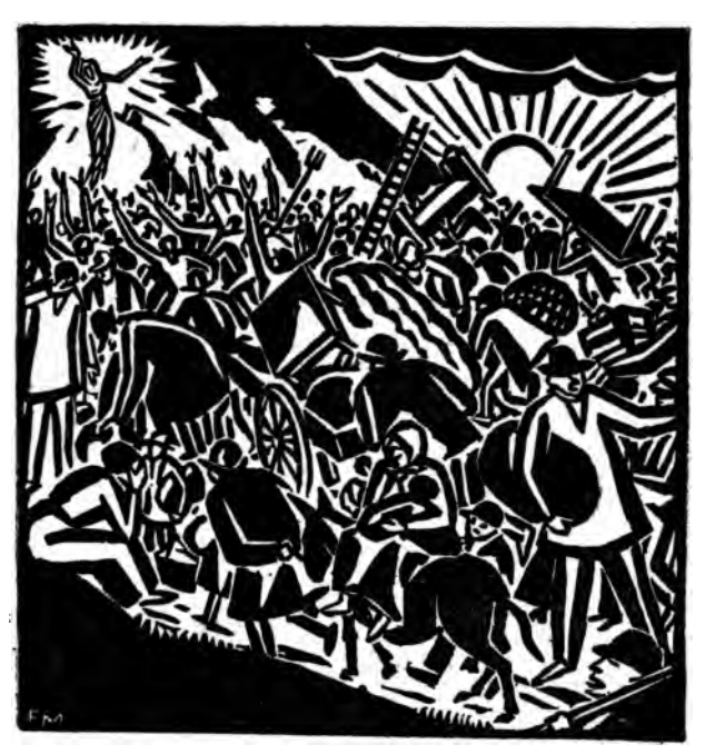
CHORUS OF YOUNG MEN AND MAIDENS

What a lovely morning! Spring laughs for joy. The blue sky is pure, intense and hard; it shines between the lovely bare branches of the trees. Under their arms the sun kisses their russet autumnal fleece. The golden carpet of dead leaves is pierced by violets. How cool, sweet and young the new air, like a straw-